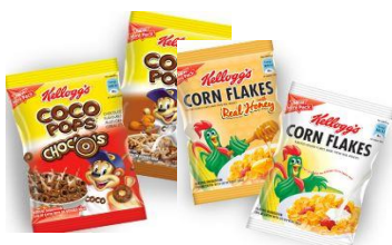
Small packet of cereal