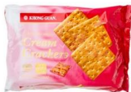
A packet of biscuits